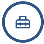
EQUIPMENT OR TOOLS